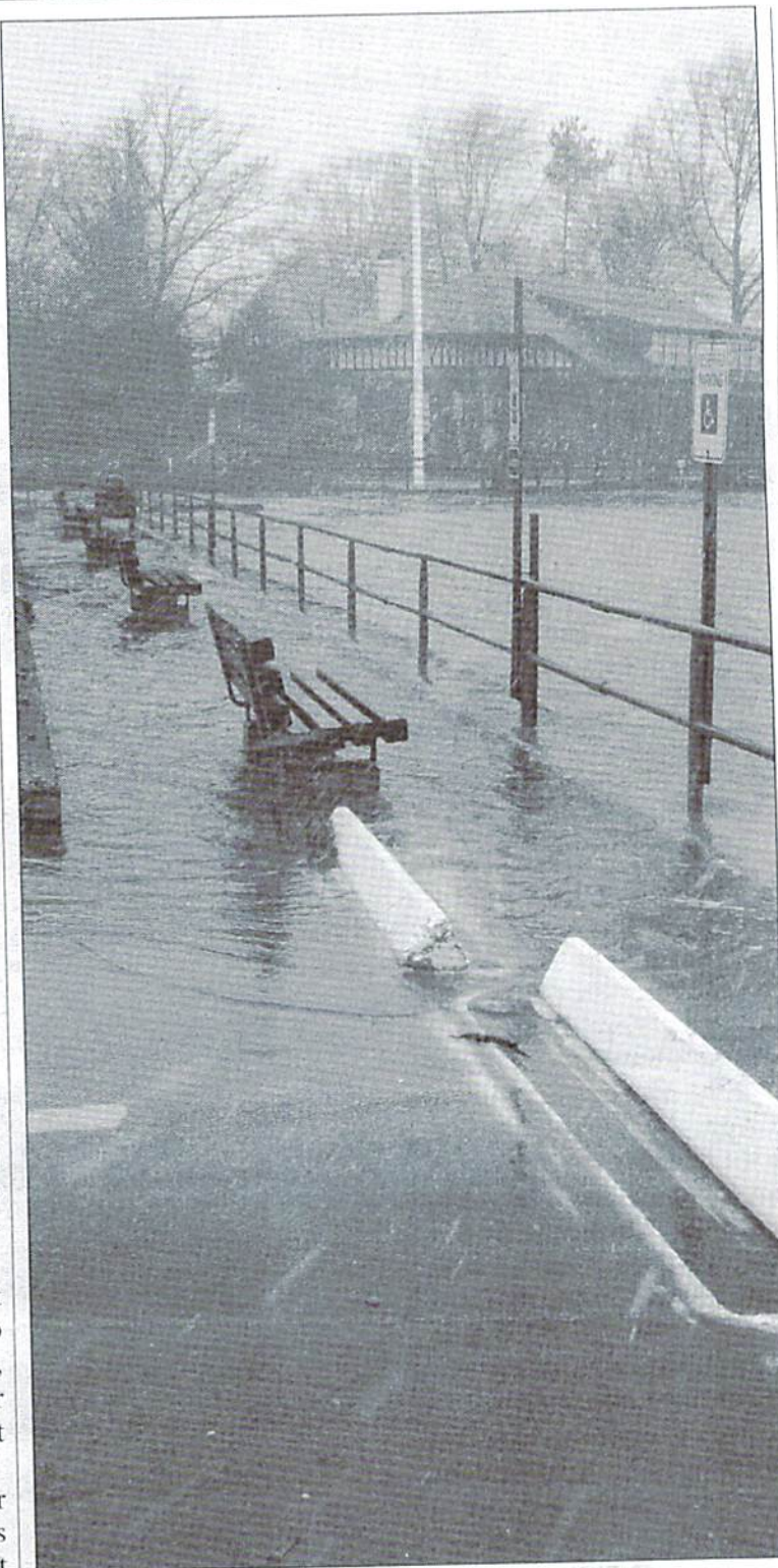
OVERFLOW LOT - High tides during Saturday's storm had sea water rising into the parking lot at the town dock. The water receded shortly thereafter, causing little damage other than leaving lumps of seaweed scattered about.

Forecasts continue to call for snow and rain, and Beers doesn't expect the weather to let up any time soon. He said he could tell this fall that a busy winter was in store.